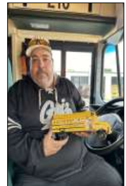
LEGO BEACH BUS!